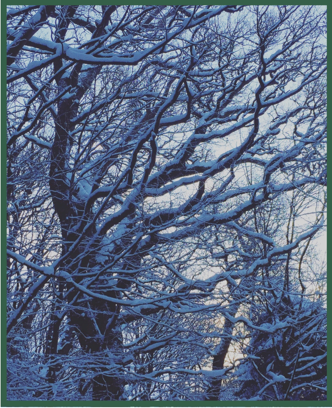
Nicola Riding - Art Competition Winner