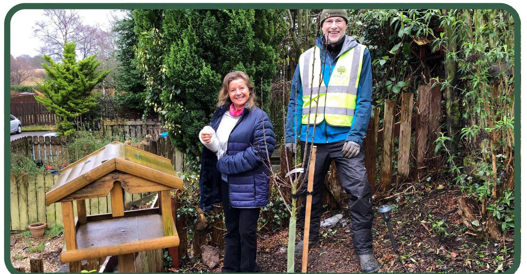
Free Nut and Fruit Trees