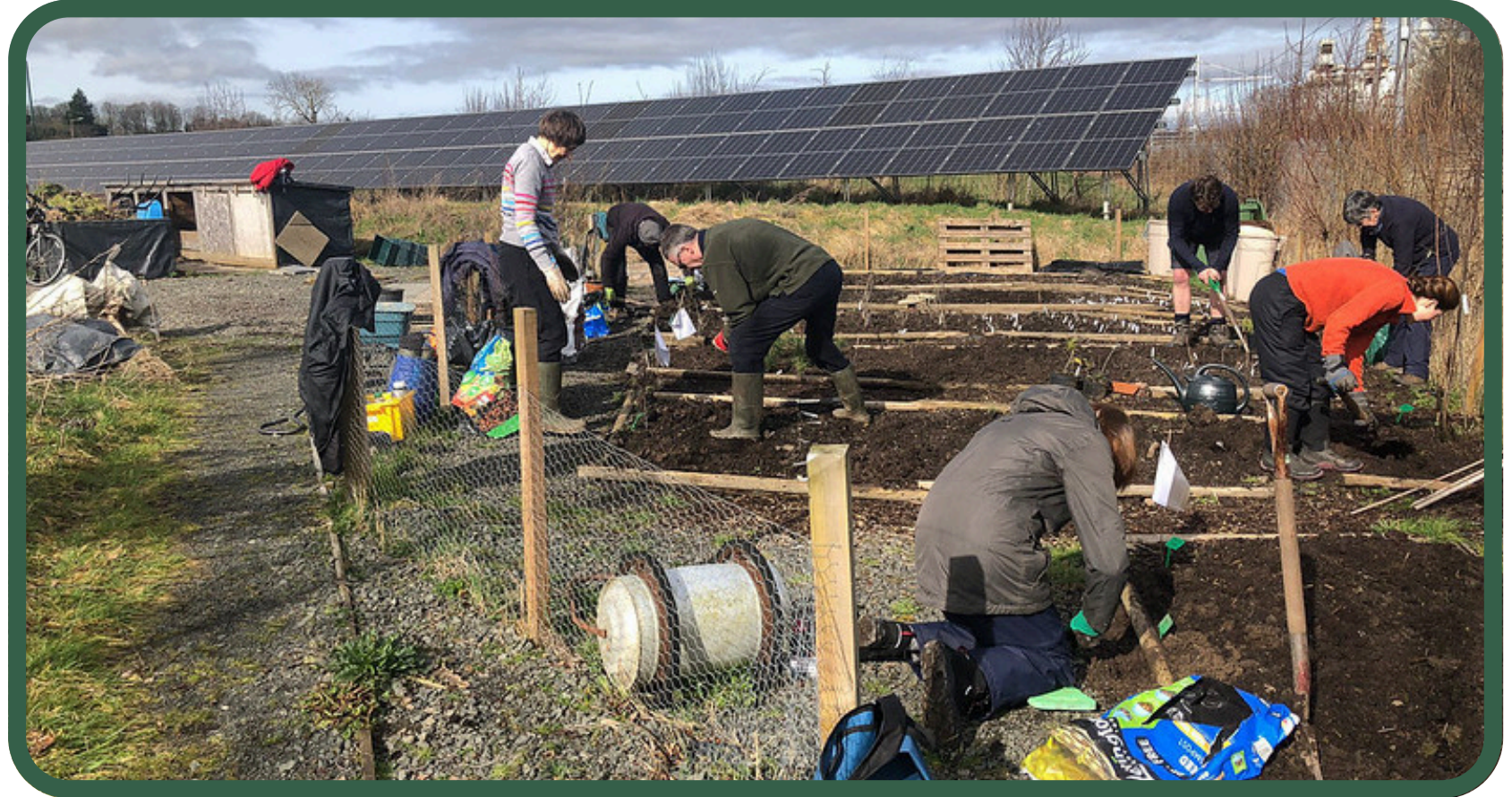
Tree Nursery Volunteer Session