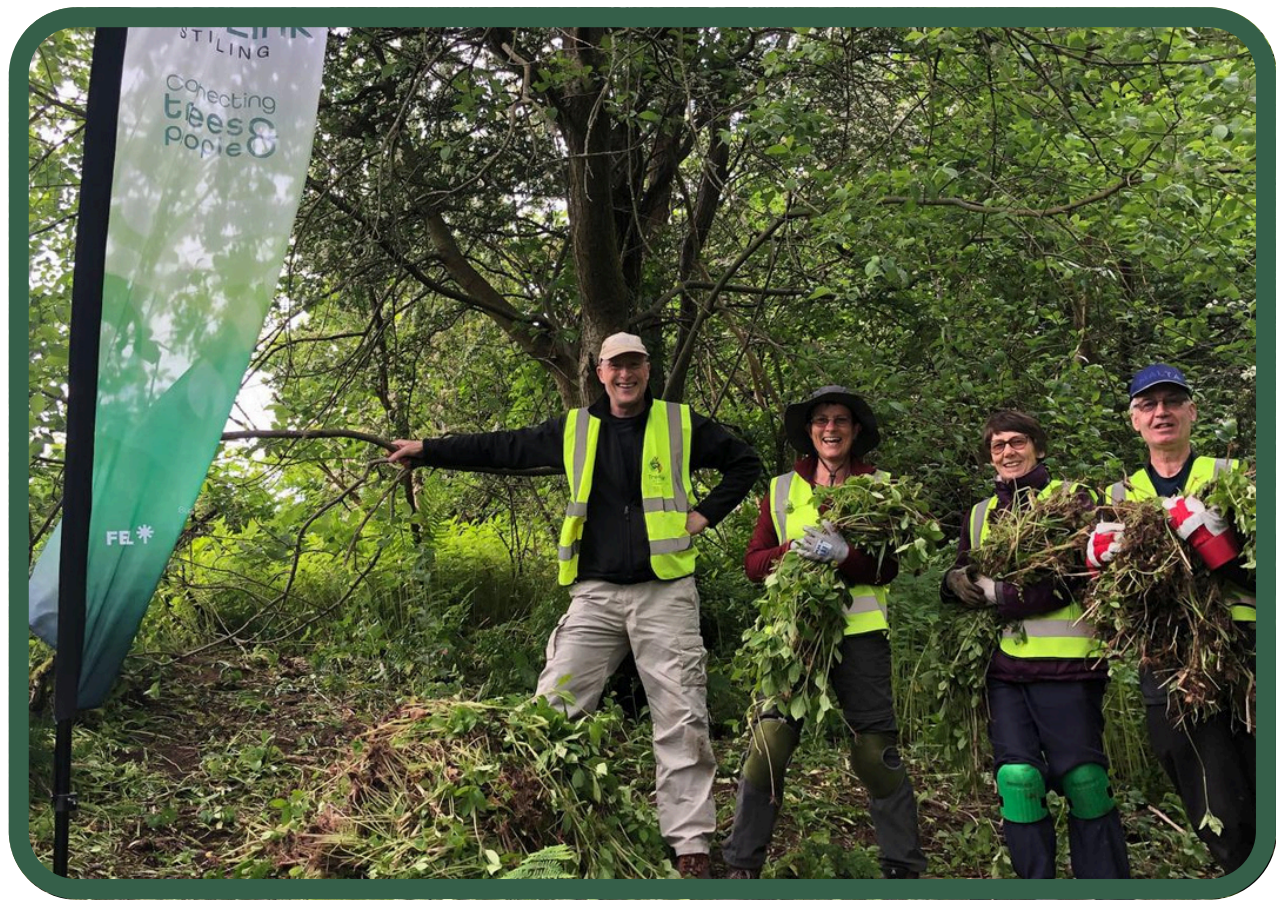
Invasive species removal

TreeLink Stirling will continue to look for opportunities to support good woodland management practices in existing woodlands, create volunteer events to care for newly planted trees and educate communities through our projects and activities.