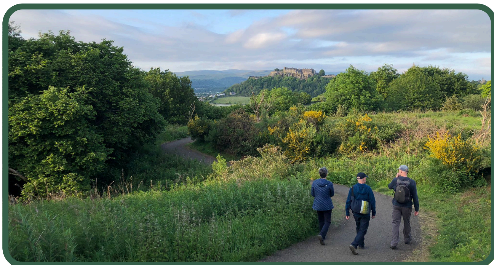
Stirling Castle from Kings Park