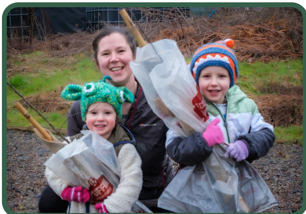
Free Trees for Babies