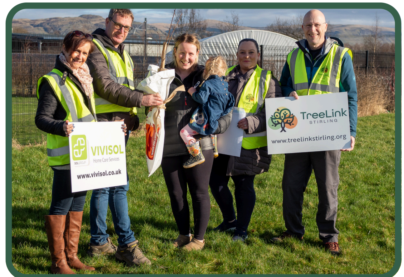
Free Trees For Babies 2023