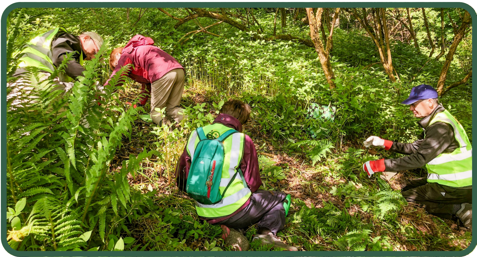
Balquhidderoch Wood, Bannockburn

In addition, according to our mission and as opportunities allow, we will support and engage with others across the region and develop new projects, where they will help achieve the purpose and aims of the organisation, are priorities for delivery and where we have the capacity to support the project.