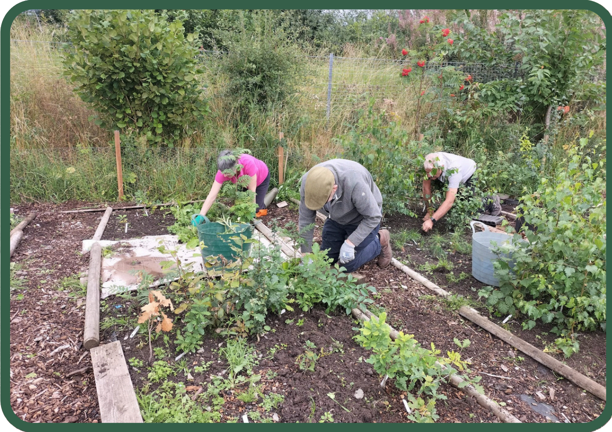
Weeding around the saplings

Tree growing is at the heart of TreeLink Stirling and all our aims. We will continue to do this through our tree nursery in Braehead Community Garden and network of dispersed growers across the Stirling region, with an emphasis on connecting people and trees, alongside tree production.